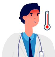
A high temperature